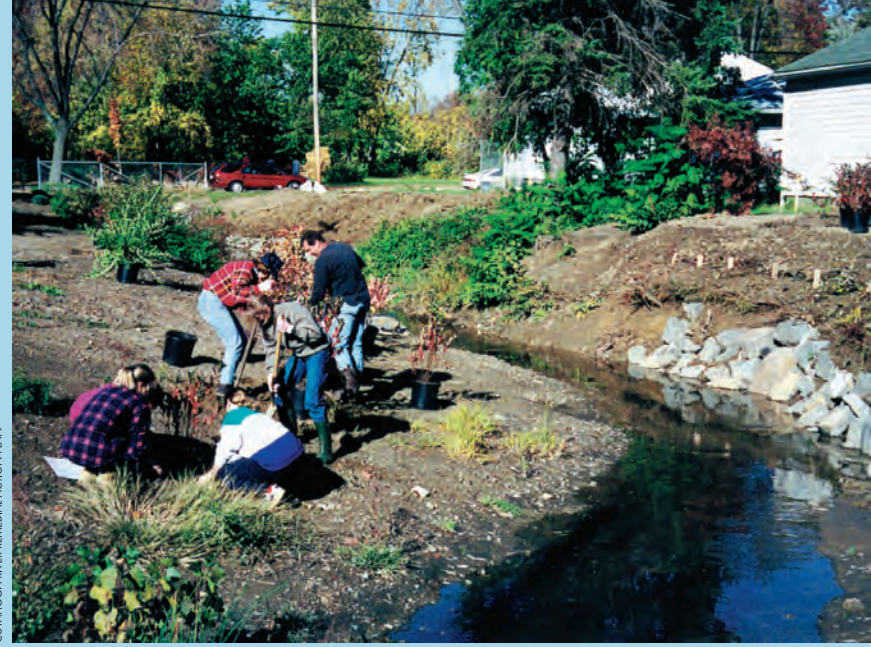
CUVAHOGA RIVER REMEDIAL ACTION PLAN