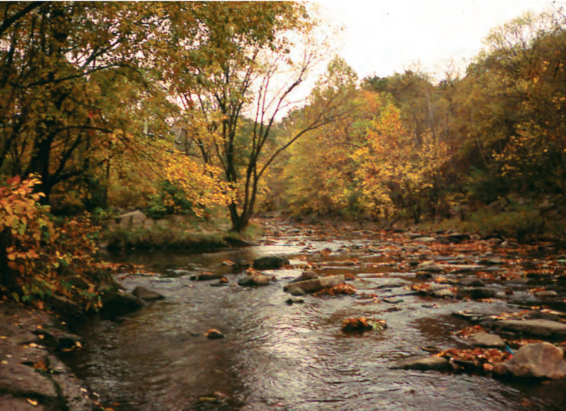
CUYAHOGA RIVER REMEDIAL ACTION PLAN