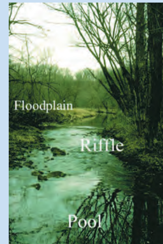
STREAM CORRIDOR RESTORATION: PRINCIPLES, PROCESSES, AND PRACTICES, 10/98, BY THE FEDERAL INTERAGENCY STREAM RESTORATION WORKING GROUP

Streams are “dynamic systems,” which means they're constantly changing over time. In our area, many of the streams are composed of alternately spaced, deep and shallow areas called pools and riffles.