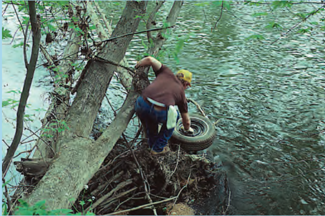
CUYAHOGA SOIL & WATER CONSERVATION DISTRICT NATURAL RESOURCES CONSERVATION SERVICE