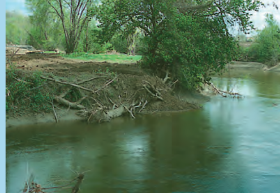
CLYMER SOIL & WATER CONSERVATION DISTRICT NATURAL RESOURCES CONSERVATION SERVICE

Yard waste (grass, leaves, pet droppings, etc.) is the 2nd largest type of all discarded trash. When these materials are put into the stream cycle, they begin to decompose and eliminate critical, life-giving oxygen in the water. As a result, these streams become unsightly and emit a foul odor.