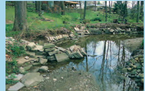
OHIO DEPARTMENT OF NATURAL RESOURCES DIVISION OF SOIL & WATER CONSERVATION

Even purposefully using concrete or rocks to build artificial walls to “shore up” the banks or change the direction of the water flow...leads to PROBLEMS, NOT SOLUTIONS. If not designed and installed properly, these structures not only damage the land and waterway...they can be DANGEROUS for you and your family!