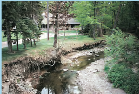
CUYAHOGA SOIL & WATER CONSERVATION DISTRICT