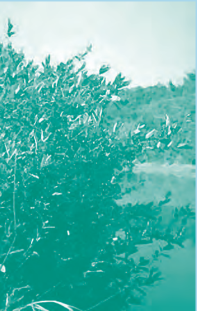
NATURAL RESOURCES CONSERVATION SERVICE