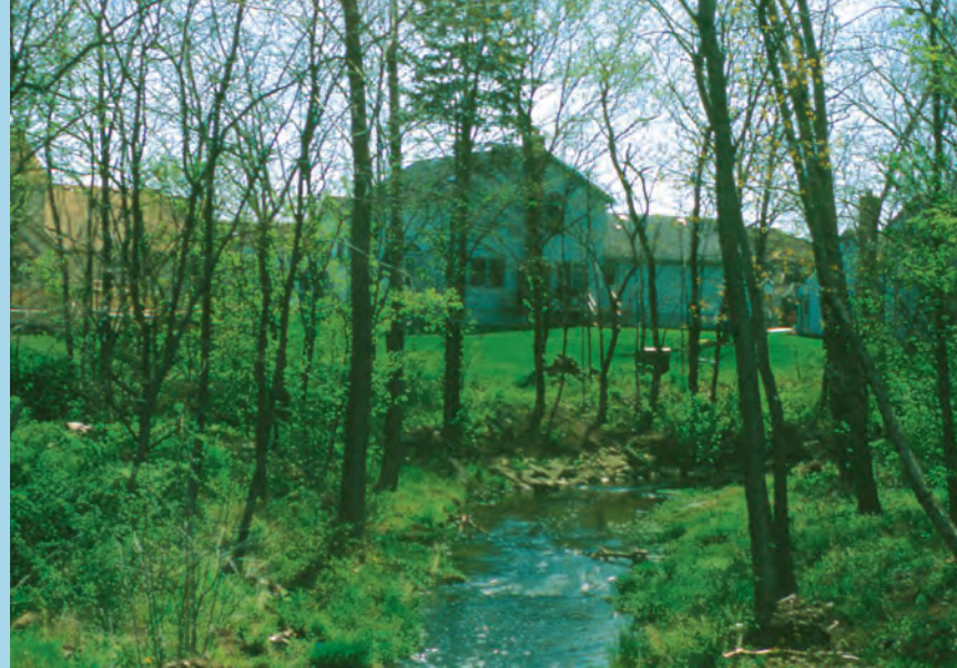
OHIO DEPARTMENT OF NATURAL RESOURCES, DIVISION OF SOIL & WATER CONSERVATION

A stream's Buffer Zone (also called the Riparian Buffer Area) is the strip of natural vegetation along the banks that separates the body of water from developed areas (lawns, buildings, driveways, etc.).