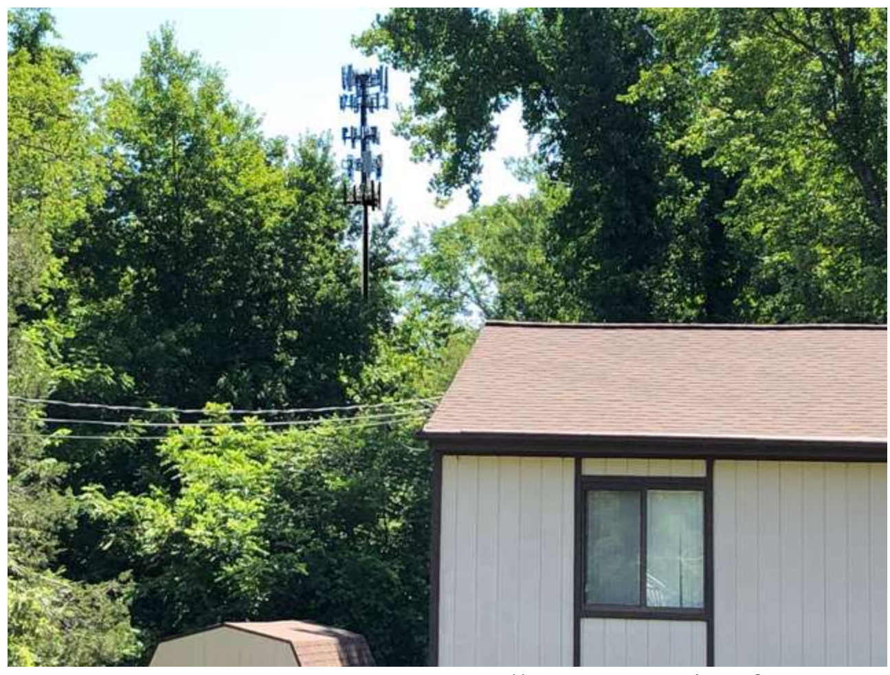
110 Caroline Drive East - Tarpon Tower Balloon Test - View from front lawn with balloon at 150 feet high. Includes view with cell tower being proposed at the 150 ft balloon test height...(it will be built to 170ft if approved)