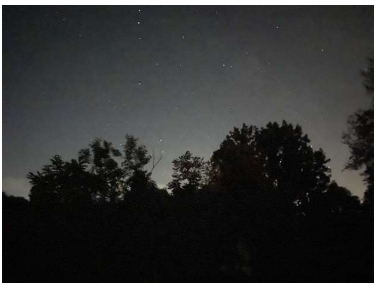
108 Caroline Drive East — Night sky in my backyard