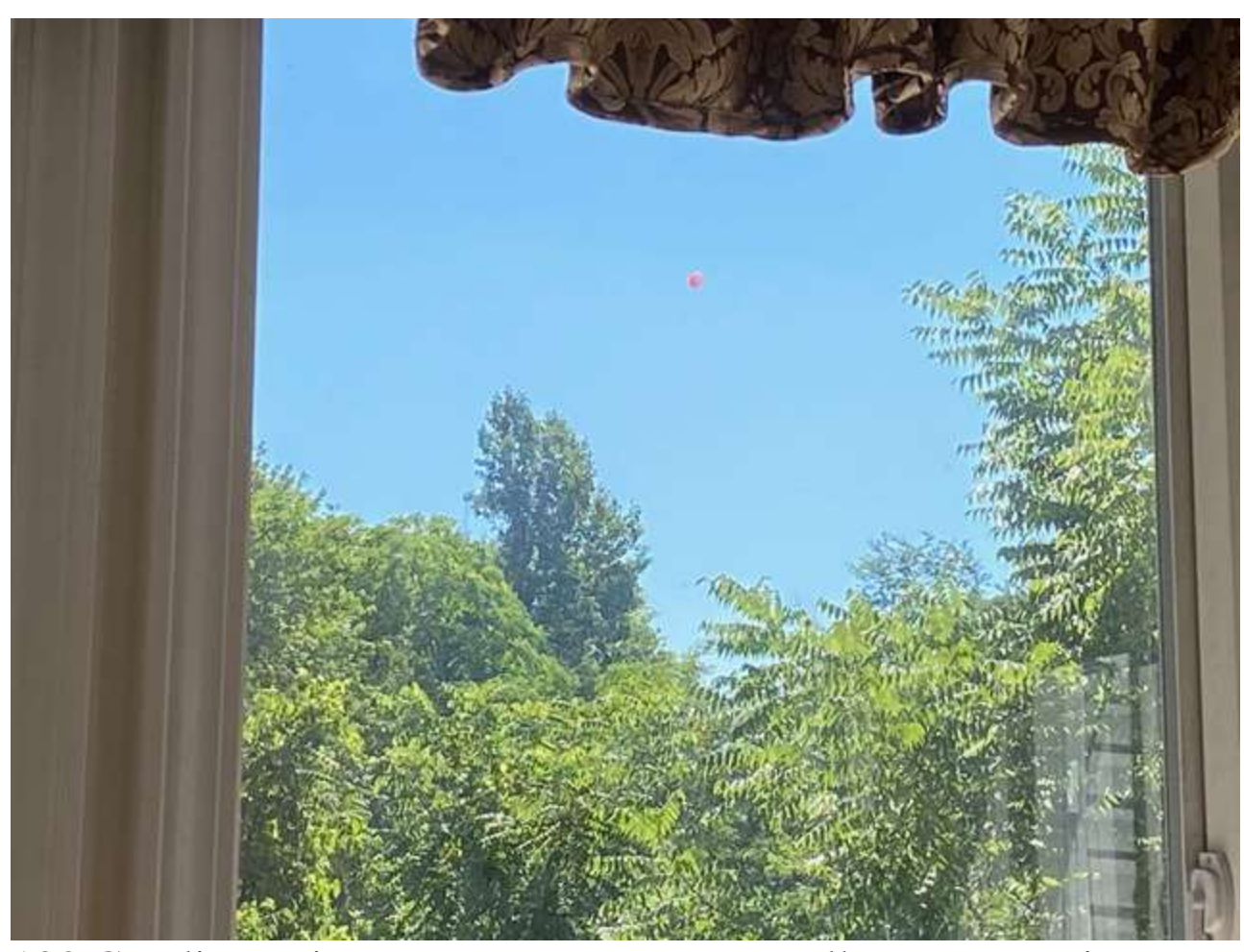
108 Caroline Drive East - Tarpon Tower Balloon Test - View from my office with balloon at 150 feet high (it will be built to 170ft if approved)