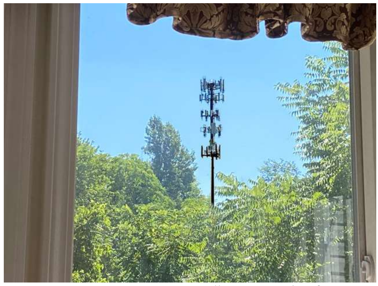
108 Caroline Drive East - Tarpon Tower Balloon Test - View from my office with balloon at 150 feet high.

Includes view with the tower being proposed at the 150 ft balloon test height...(it will be built to 170ft if approved)