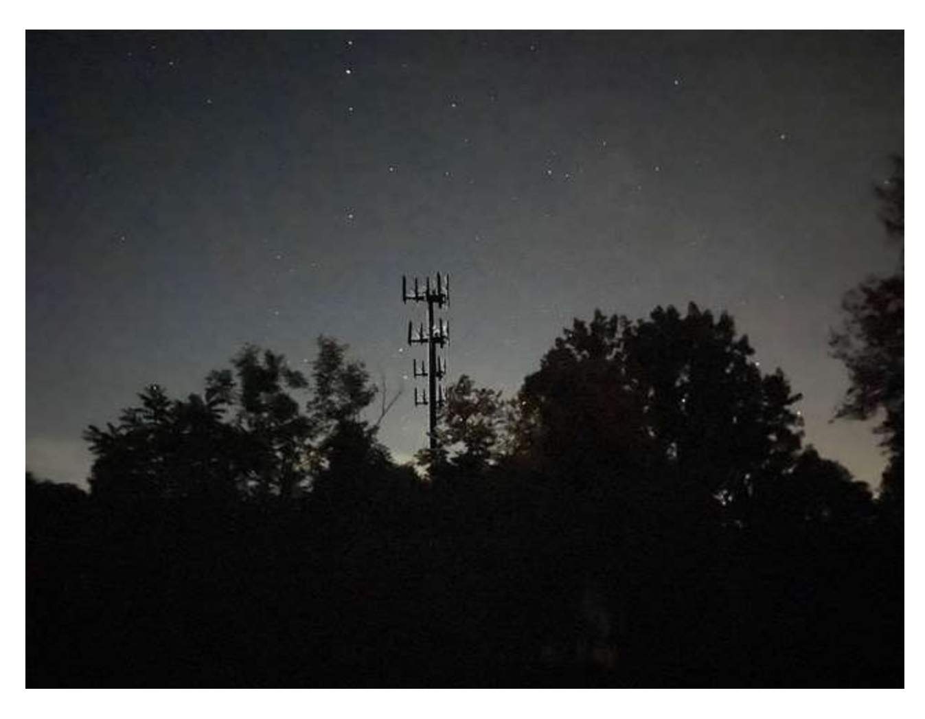
108 Caroline Drive East - Night sky with a cell tower in my backyard