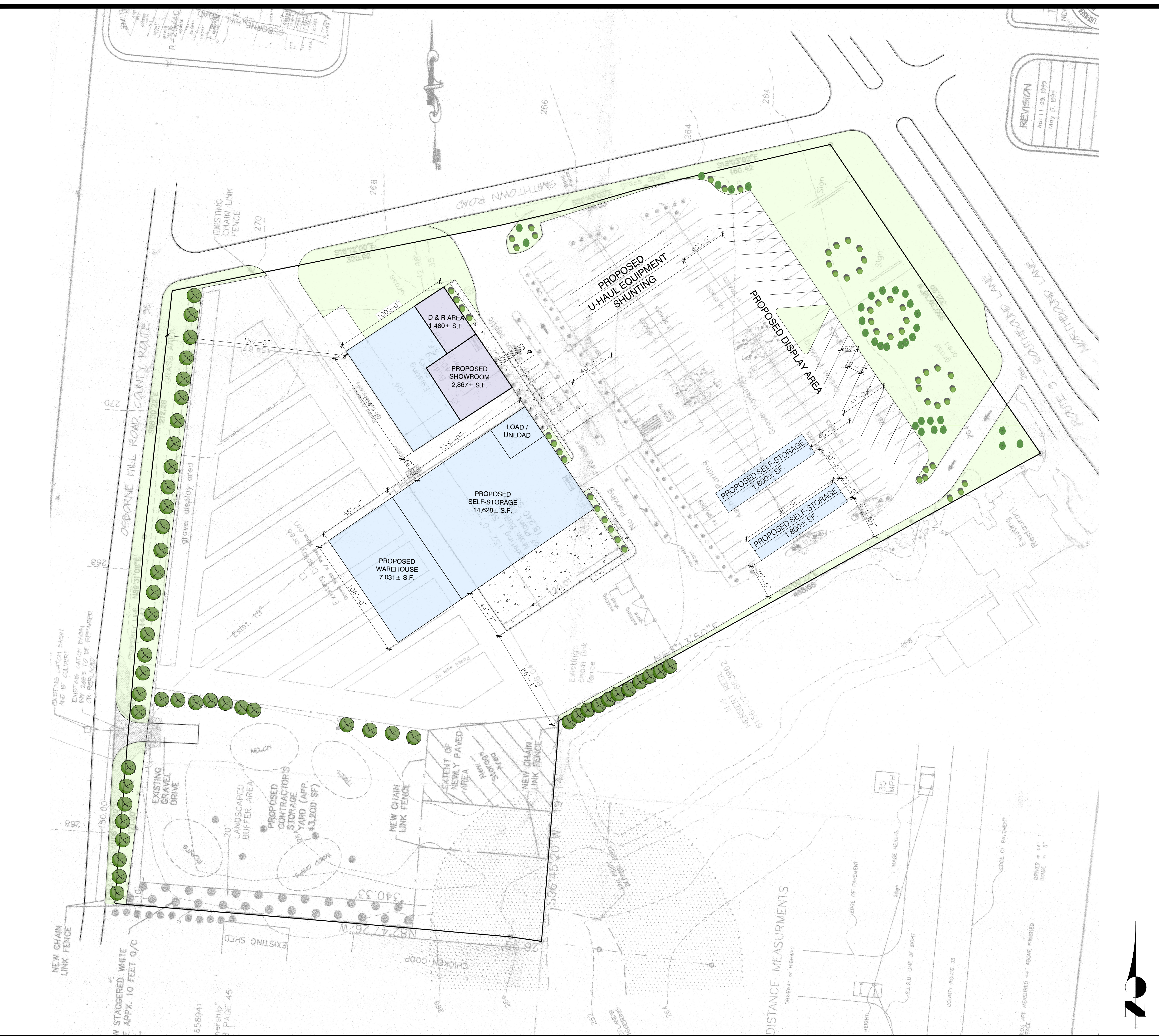
PRELIMINARY SITE PLAN