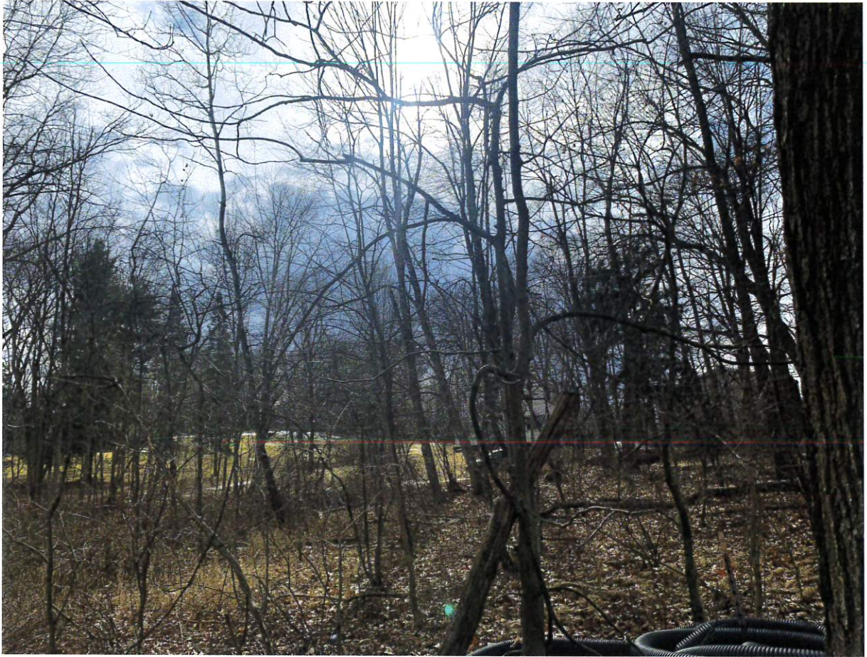
Photo 3: View of the Nearest Neighbor to the Rear of the Parcel From the Back of the Hoop House in Leaf Off Condition