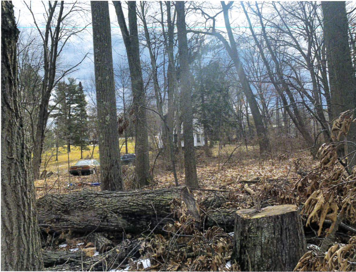
Photo 6: View of the Neighbor to the Rear From the Poly Tanks in Leaf Off Condition