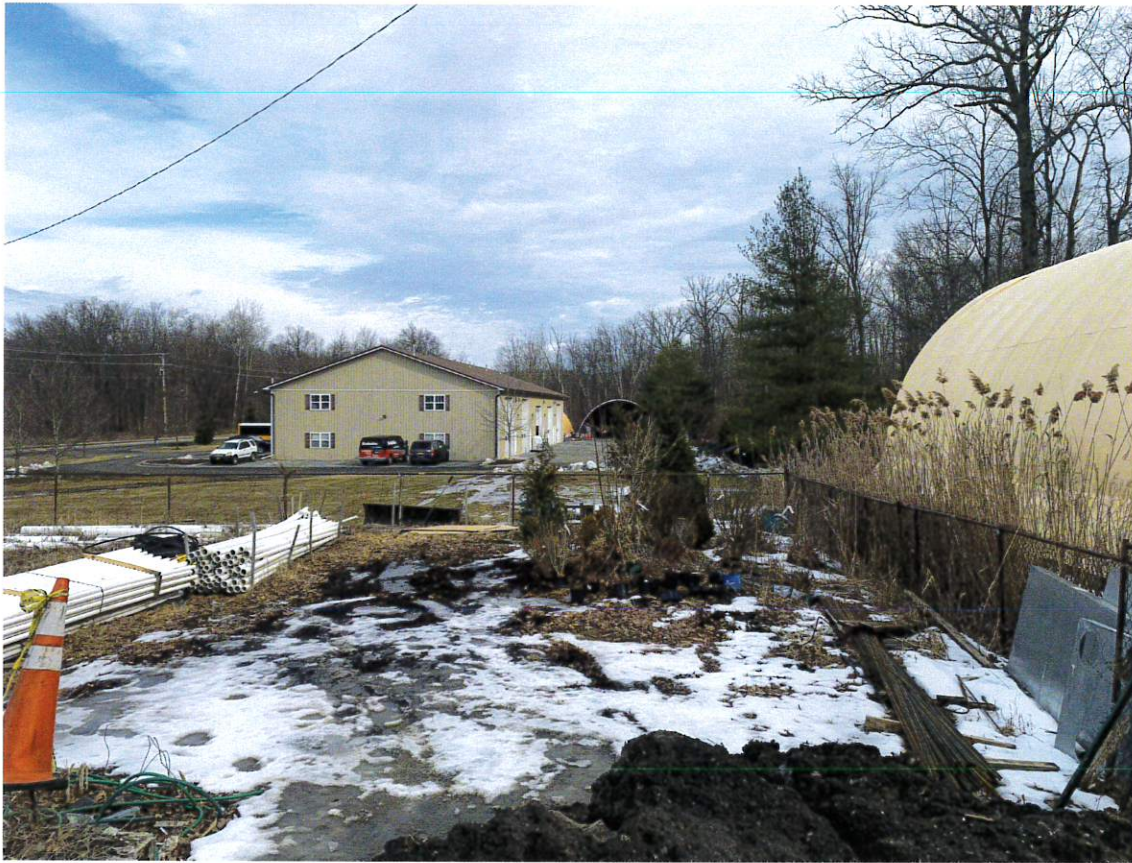
Photo 2: View of the Side Neighbor to the East From the Hoop House. Note the Hoop Houses of the Parcel to the East