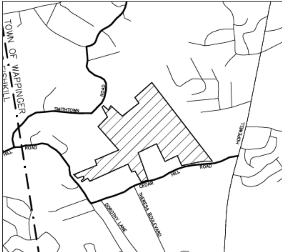
Figure 1 Location Map