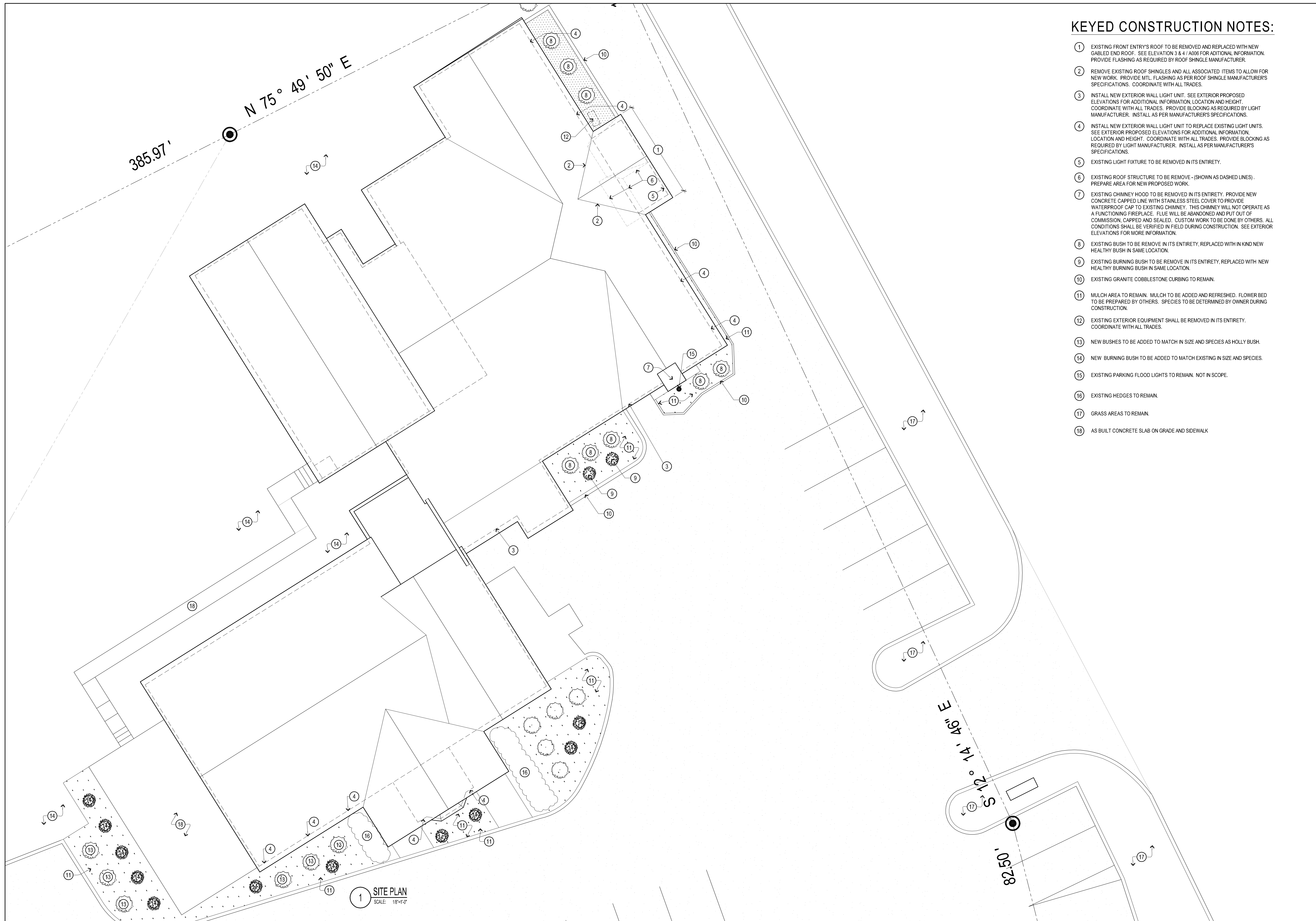
1 SITE PLAN SCALE: 1/8"=1'-0"